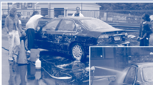
Board members and students working together at the car wash.